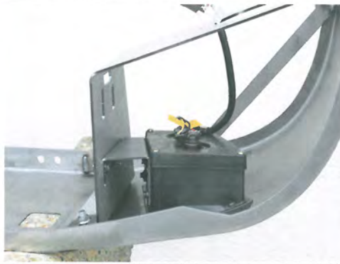
VCP light bracket & factory light mount to VCP Bumper Mounting Bracket