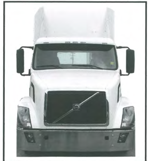
VCP Bumper Shown w/ Factory Lights Installed