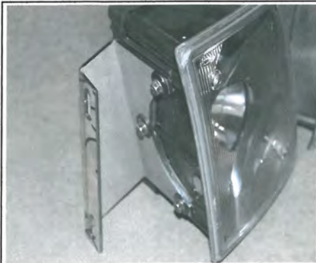
VCP Light Bracket attaches to factory light (re-use factory bolts)