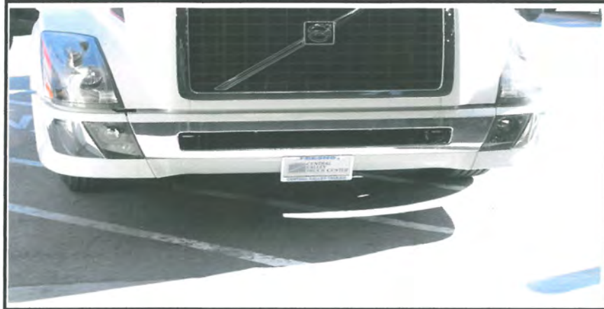
Factory Bumper Shown