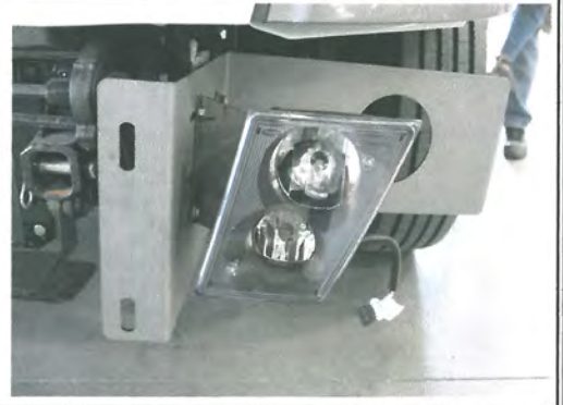
VCP Mounting assembly mounted to truck Do not tighten bolts until bumper is installed. (ready for bumper installation)